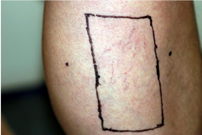
Subject 5 before