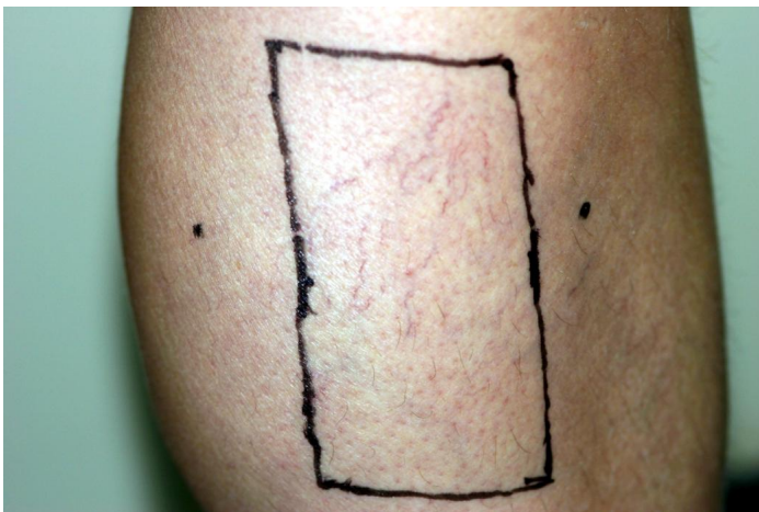
Subject 5 After 30 minutes