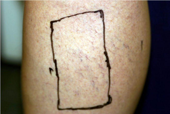
Subject 3 before