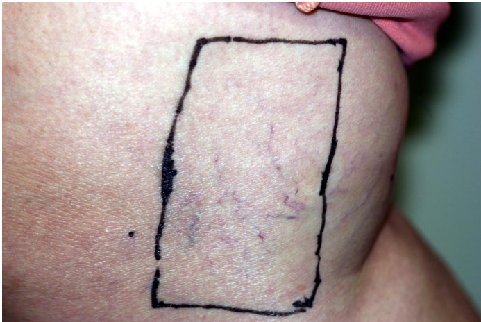
Subject 2 After 30 minutes