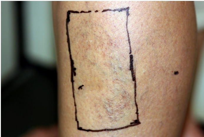
Subject 1 After 30 minutes