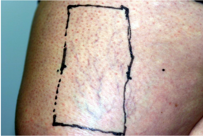
Subject 4 before