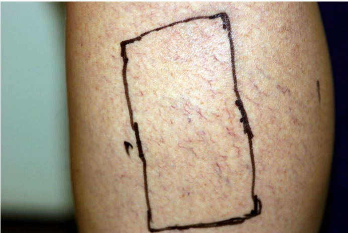
Subject 3 After 30 minutes