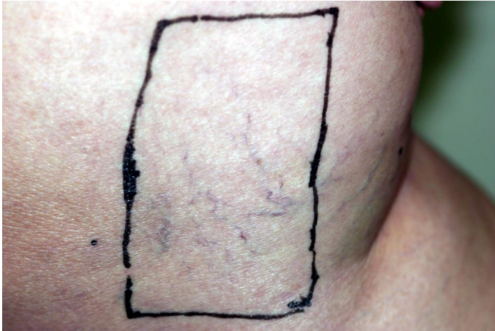
Subject 2 before