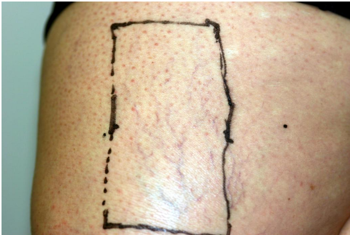
Subject 4 After 30 minutes